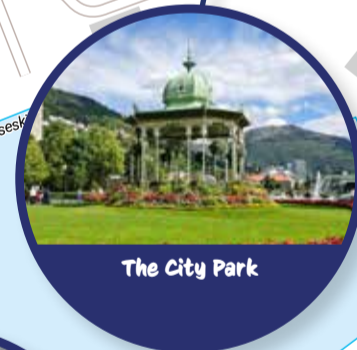
The City Park