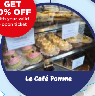
Le Café Pomme

GET 10% OFF with your valid Hopon ticket