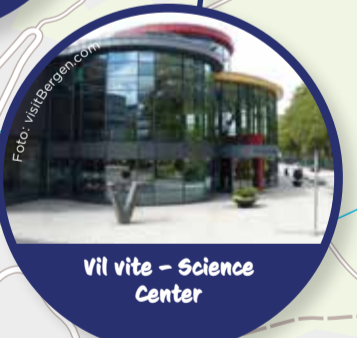
Vil vite - Science Center