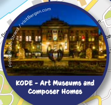
KODE - Art Museums and Composer Homes